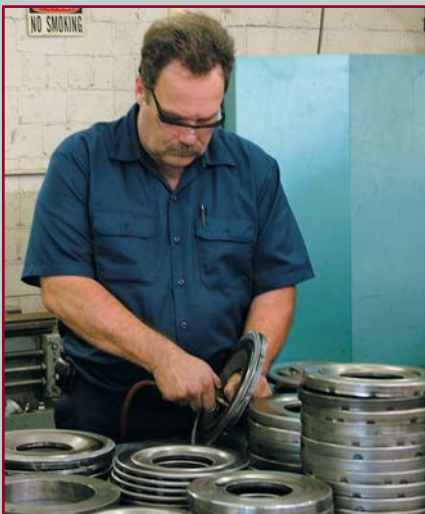
Pistons are processed and prepared before the crucial bonding step.