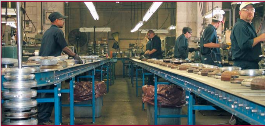
CVC's two production lines run parallel to each other at this point near the center of the factory.