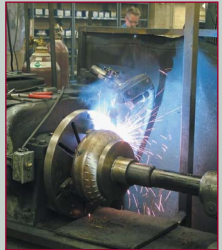
After the converter is rebuilt with all the CVC improvements incorporated, the components are assembled and welded.