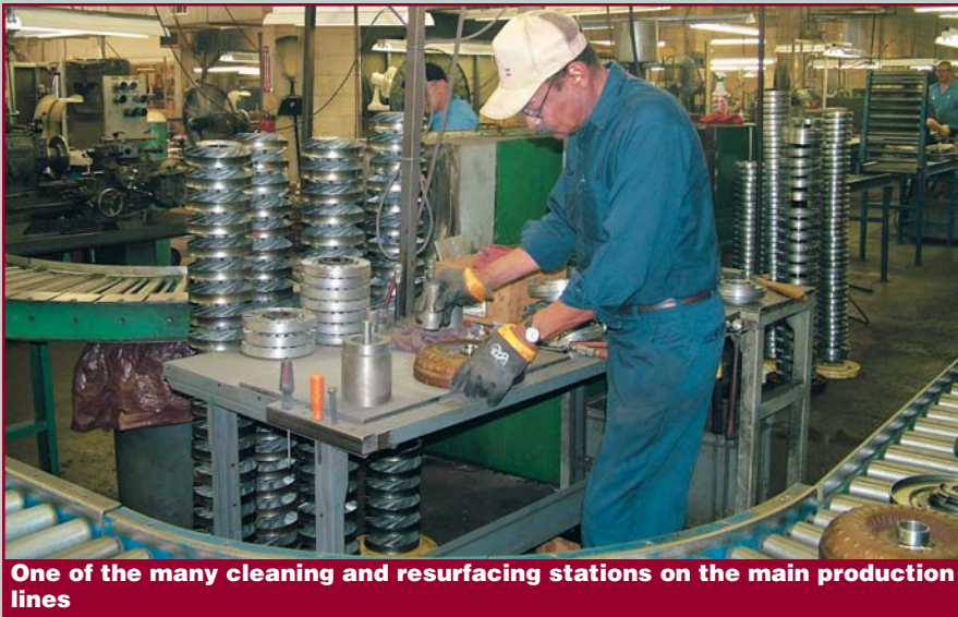
One of the many cleaning and resurfacing stations on the main production lines