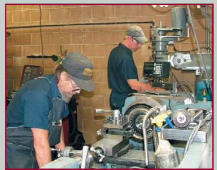
Computer controls help assure work that meets tight tolerances on these lathes.